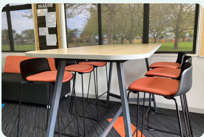
Gather High Table and Ascend Bar Stools