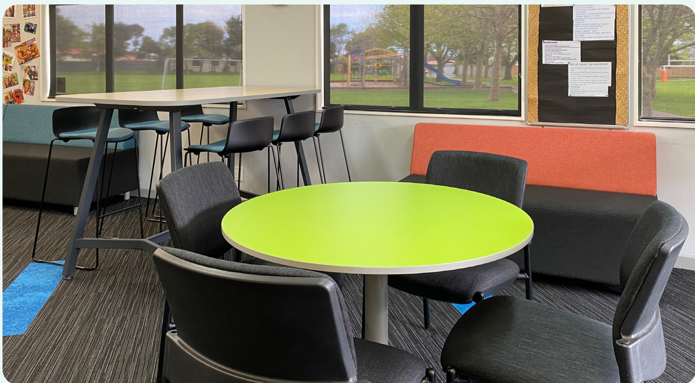
Tiered seating options created with Soft Furnishings from our Base Collection and our Gather High Table paired with Ascend Bar Stools